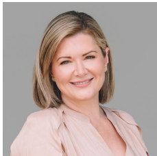
Athena Law 07 5442 1855

This ultimate hinterland escape offers an expansive main residence, charming guest cottage, caretaker's residence and a large shed, all nestled within spectacular landscaped