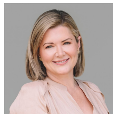
Athena Law 07 5442 1855

Price : Offers Invited: Low to Mid $2M Range Building Size : 401 sqm Land Size : 4000 sqm View : https://www.propertylane.com.au/sale/qld/sunshine-coast/forest-glen/residential/house/7888514