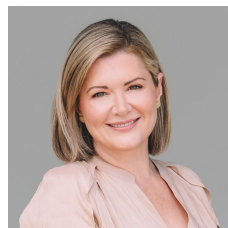
Athena Law 07 5442 1855

Building Size : 401 sqm Land Size : 4000 sqm View : https://www.propertylane.com.au/sale/qld/sunshine-coast/forest-glen/residential/house/7888514