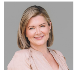
Athena Law 07 5442 1855