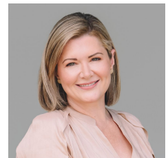
Athena Law 07 5442 1855