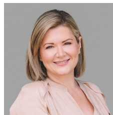
Athena Law 07 5442 1855

Price : $ 720,000 Land Size : 805 sqm View : https://www.propertylane.com.au/sale/qld/sunshine-coast/nambour/residential/house/7972696