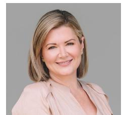
Athena Law 07 5442 1855