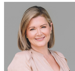
Athena Law 07 5442 1855